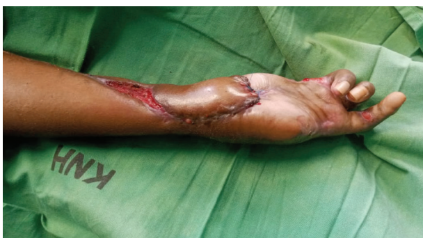
Figure 3: Final results post flap division.