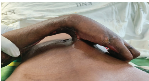
Figure 2: Flap in situ before division.